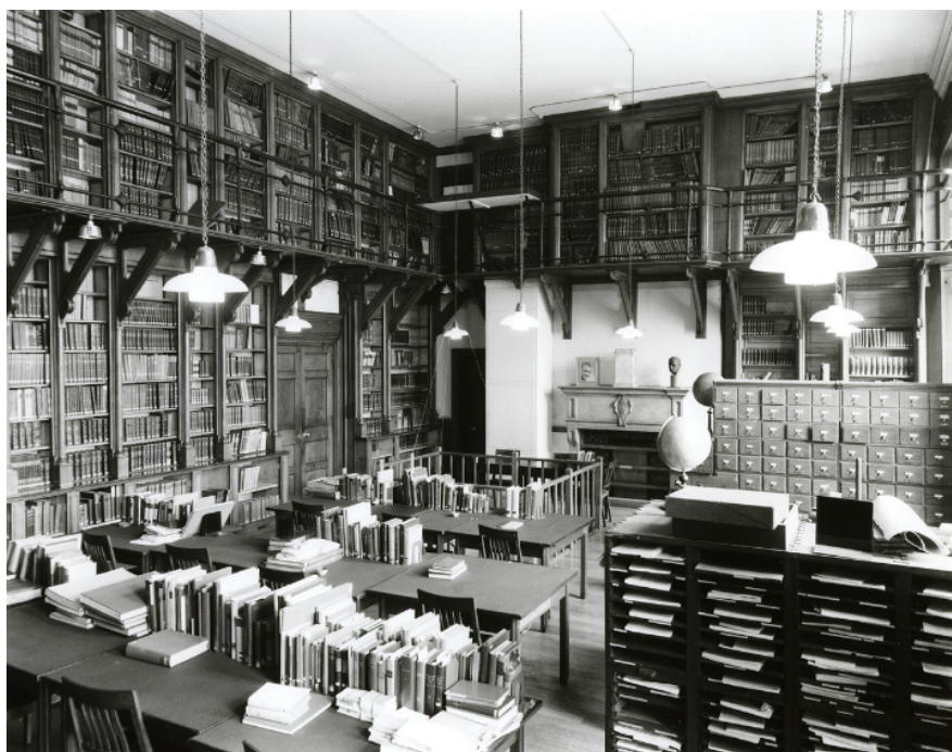
1 | Sala di lettura del Warburg Institute presso l'Imperial Institute di South Kensington tra il 1936 e il 1957.

Pubblichiamo in questo numero di Engramma un testo di Gertrud Bing scritto all'indomani dell'arrivo della Warburg Library in quello che diventerà il Warburg Institute di Londra, pubblicato inizialmente per circolazione privata e riedito con il titolo The Warburg Institute in "The Library Association Record", Fourth Series, I, 8, 1934, 262-266.