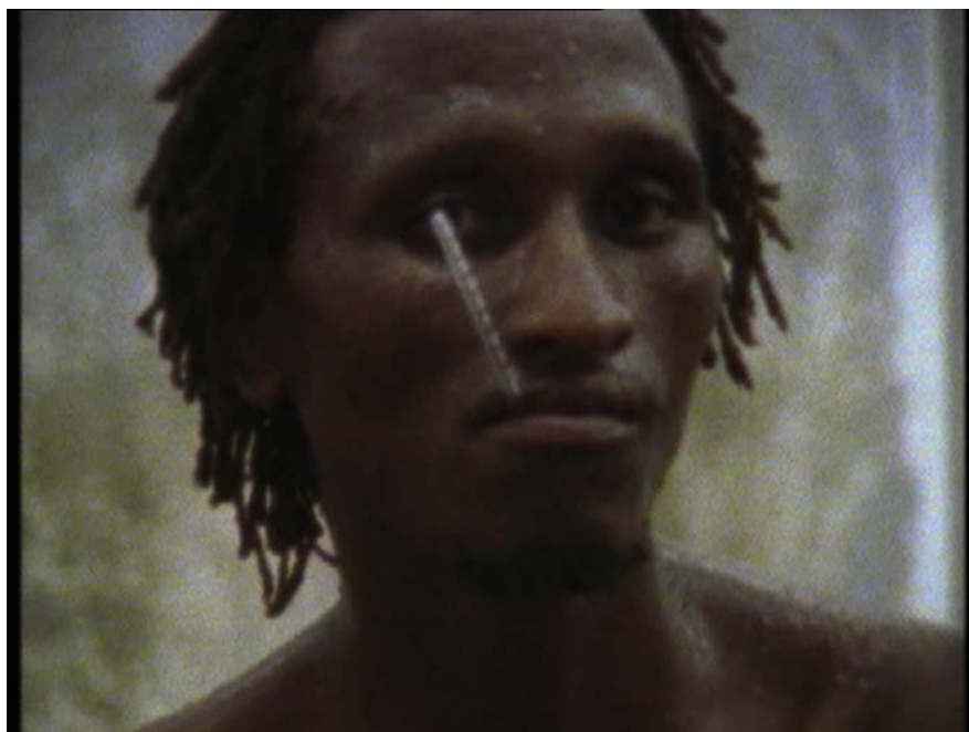
2 | Steve McQueen, Western Deep , 2002, film still.

to the forefront. All this charges the films with ambiguity, and compels us to let our gazes, our minds, our bodies to be trapped by the moving images. It hurts on purpose: by being engaged and fascinated, we become prisoners of a dangerous game. One of the aims of the director is that we feel slaves, too, by inverting the sentiment about ourselves as free selves.