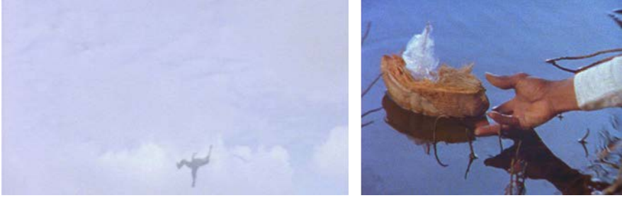
3-4 | Steve McQueen, Carib's Leap , 2002, film stills.

The short film that explores the Statue of Liberty from the discontinuous, circling perspective of a camera on a helicopter ( Static , 2009), with constant changes in altitude, whirring noises, and sudden disorienting cuts, is an unequivocal reflection on this: freedom or rather the Enlightenment ideals of personal liberty as a legitimate aspiration, whose lack creates a creepy state of unbalance. Liberty has been the key concept of the American Declaration of Independence (1776), which was the first political document to found a nation on the rights of human beings and specifically on the right to pursue personal happiness. The film shows us its symbol up close, green from oxidation, damaged in places, surrounded by a New York that looks purplish from this aerial perspective, and set against a grey sky bristling with skyscrapers. The camera's eye roams in a circle as if seeking a foothold. Still, we find ourselves in a position of instability, with an emphasis on the relative nature of all observed values, but also – to expand the metaphor – of all the moral values the statue is meant to embody. The theme that emerges is thus the lack of collective liberty, a historical failure and betrayal that is specially embodied by racial inequalities, but far from being limited to that.