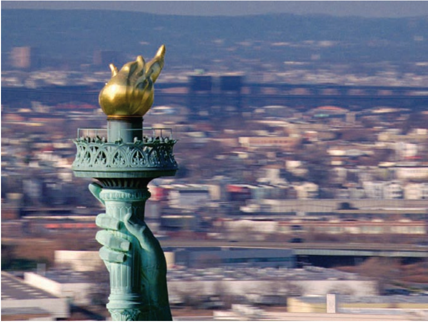
5 | Steve McQueen, Static , 2009, film still.