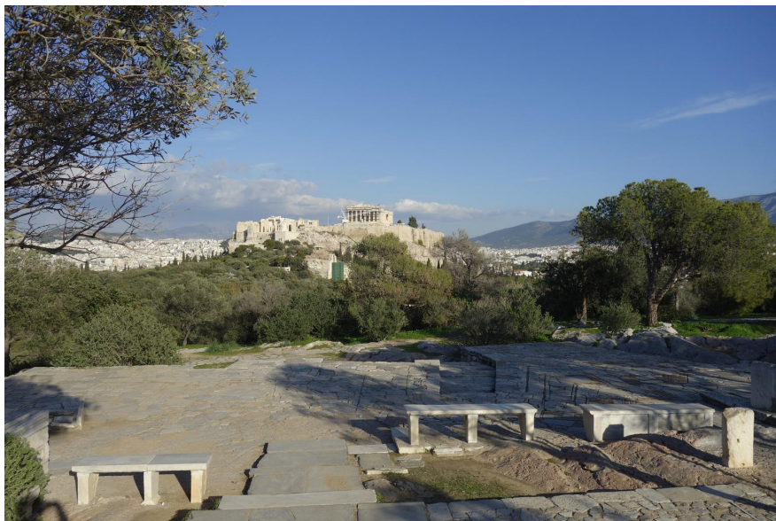
7 | The benches facing the Acropolis, photo by the author.

This Kantian perspective establishes an interesting framework for reading the relationship between Pikionis' architecture and nature and metaphysics as part of an idealization process. In each one of Pikionis' projects there was always a constant reference to an ideal image, from the very first sketches to the supervision of the final construction. The design always referred to an ideal, platonic image that pre-existed and is 're-discovered' each time, again and again. This constant and repeated quest for the ideal image was the result of idealization because without this constant ideal reference nothing could be created (Pollock 2006).