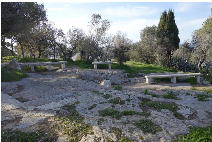
6 | The benches on the belvedere, photo by the author.

But on this particular day what pleases me most is to concentrate on the spectacle of the ground bathed in calm, wintry light [...] I stoop and pick up a stone. I caress it with my eyes, with my fingers.