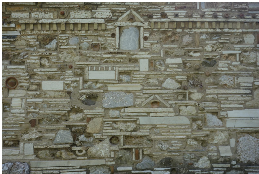
4 | One of the walls of St. Demetrius, photo by the author.

Around the church of St. Demetrius, the number of symbolic images increases and the visual impressions become richer and denser. The old church was extended, clothed entirely in a new symbolic 'garment' on which disparate forms of a single continuous tradition come together [Fig. 4]. It was not only the pieces of ruined neoclassical houses, the stone and ceramic fragments of the Attic land, that were embedded in the floors and walls: the wall becomes a field where objects, elements, and figures from Ancient, Christian and Modern Greek history and mythology coexist: urns, Kouroi, horses, ancient Greek deities, Christian saints, wooden boats, archaic gates, eagles, deer, rosettes, spirals, coils, meanders, warriors of antiquity and heroes of the Greek Revolution of 1821, medusas, trees, fish, flowers and plants, lions, and ancient temple façades... As long as one can decipher what they see the walls of the church 'speak', narrating mythical incidents and activating the historical memory [Fig. 5].