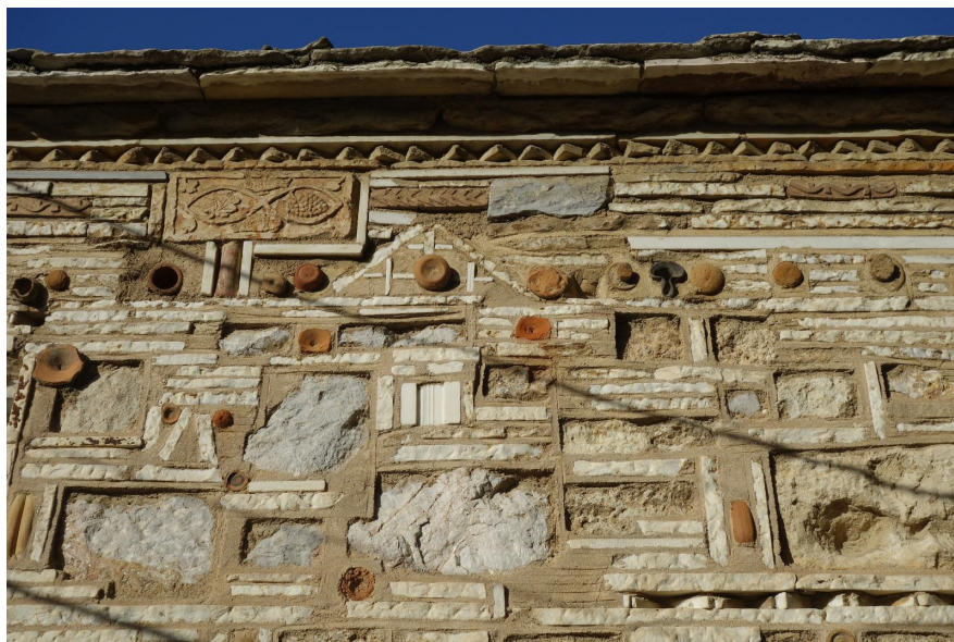
5 | One of the walls of St. Demetrius, photo by the author.

positioned. Scattered in the belvedere and distanced from one another, all the benches face in the same direction, as if a distant magnet is drawing them to it [Fig. 6]. It is clear that this magnet is the Acropolis where all the benches are directed towards, ‘viewing’ it. All the benches position the visitor at points from where the view of the Acropolis is the best possible, points from where the image is the ideal [Fig. 7].