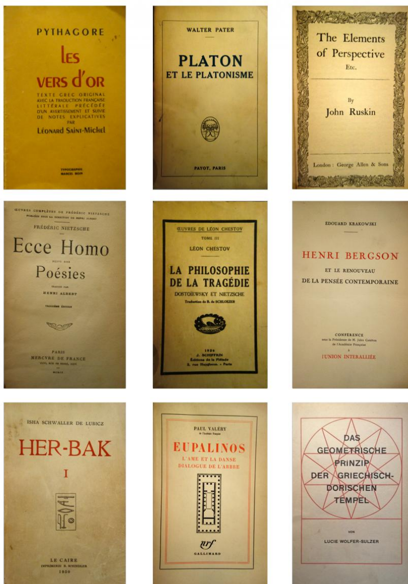
1 | Books from Pikionis' personal library, ©Kostas Tsiambaos.

These figures, along with many others, coexist in Pikionis' talks (Philippides 2009) and manuscripts, communicate with each other and cross paths unexpectedly, forming a vast body of multivalent influences.