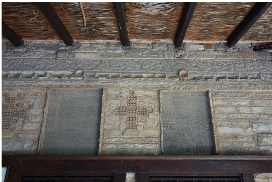
9 | The visible concrete beams of St. Demetrius extension.

Additionally, the polar optical alignments of Doxiadis' theory used by Pikionis were nothing but invisible visual threads 'enchaining' the buildings to each other; threads that visually shackled the buildings to their surrounding environment, stabilizing and immobilizing them in space. Here again, the intention was for space, time and architecture to 'freeze' in a stable condition, an ideal condition. Similarly, the observer should remain stationary and motionless if they are to capture the perfect visual image and see the ineffable harmony, in turn connecting the real with the ideal. Both this motionless mathematical order of space and the stillness of the observer themselves are essential in order for everything to be exactly where it should be. The polar alignments link structures in space, freeze time and stabilize the spectator in a certain fixed spot, the ideal spot, the spot of idealization.