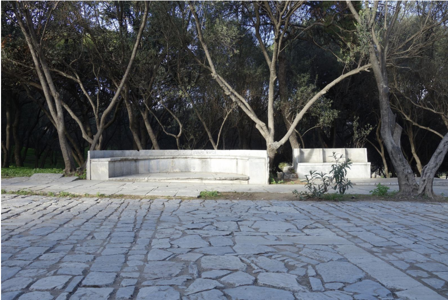
8 | Pikionis' benches in dialogue with the trees, photo by the author.

In the construction of St. Demetrius, for example, the covering of the original façade with a new one representing the ideal form, is indicative of the above thought. The new 'clothing' of the building attained the ideal and its new form was nothing if not an expression of this ideal. This idealization certainly became particularly violent once the new façade clashed with the existing building. The original medieval church was not preserved in its original state but it expanded (tripled in size) and has been covered with a new façade [Fig. 9]. The original St. Demetrius, or whatever was left over the centuries as an authentic historical body of archaeological value, 'disappeared'. It is clear that Pikionis was not interested in the actual structure itself, the conservation of an objective historicity, the living physical evidence of the past. Even if the original Byzantine church still existed under this new façade, it was transformed and revived as something else. It became a new St. Demetrius, in fact, an ideal St. Demetrius. This idealization was reflected in this violent renovation-revival, in the mandatory conformity of the church with its ideal image, in the final redesign of the new church as a meta-historical built representation of the ideal.